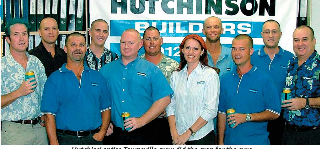
Hutchies' entire Townsville crew did the crop for the cure.