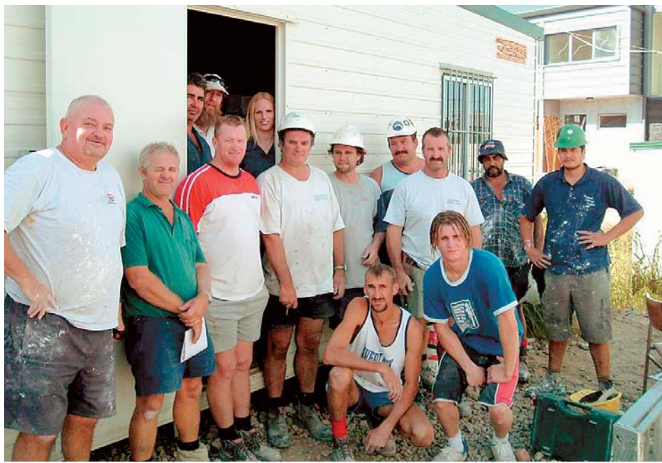
Some of Hutchies' HIL team.

foremen to create a smooth running job site and, wherever possible, strive to push the construction program and other trades forward. HIL currently has a team of 30 working on projects and looks forward to a positive and profitable future.