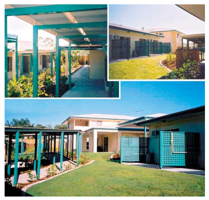
The Village Life project located in Gladstone.

HUTCHIES'Toowoomba office has developed a reputation as retirement home specialists having completed, or working on, a total of 11 projects for Village Life, with a combined value of $27.5 million.