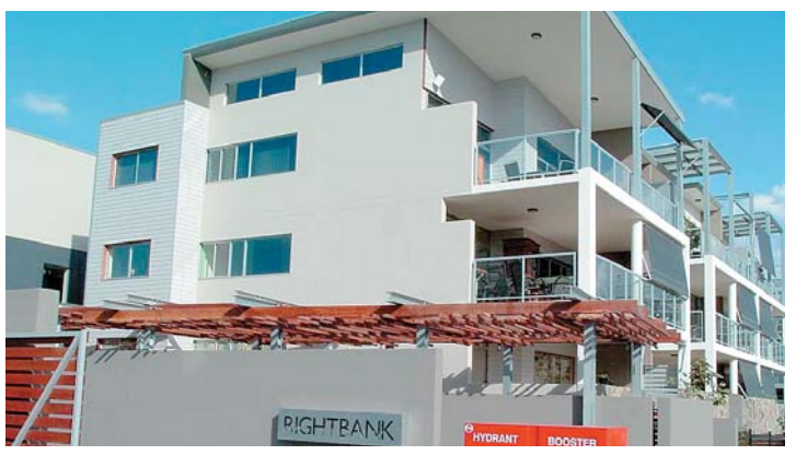
HIL projects - The Edge Apartments and Rightbank Apartments, both at the inner Brisbane suburb of Bulimba.