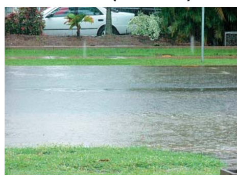
HUTCHIES' Townsville office has occasional water views – depending on how hard it rains during the Wet – which causes havoc on the building sites, but it does give the office staff something to look forward to during the tropical downpours.