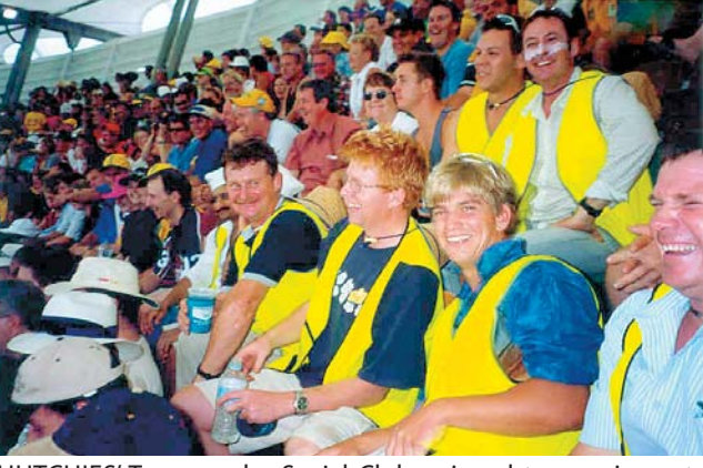
HUTCHIES' Toowoomba Social Club enjoyed two major outings during the year – one to the Granite Belt wine region and the other to the One Day International at the Gabba.