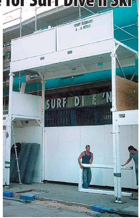
Day one of the new Bondi Surf Dive n Ski store ... the erection of hoarding and scaffolding.

Once completed, the Bondi outlet will be the flagship store for New South Wales.