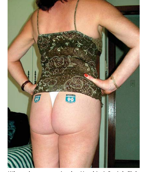
When the women in the Hutchies' Social Club enjoyed a weekend getaway onboard the cruise ship, Super Star Leo, one of them couldn't leave her feelings for Hutchies behind. She included Hutchies' g-string and tatts in her holiday wardrobe to great effect.