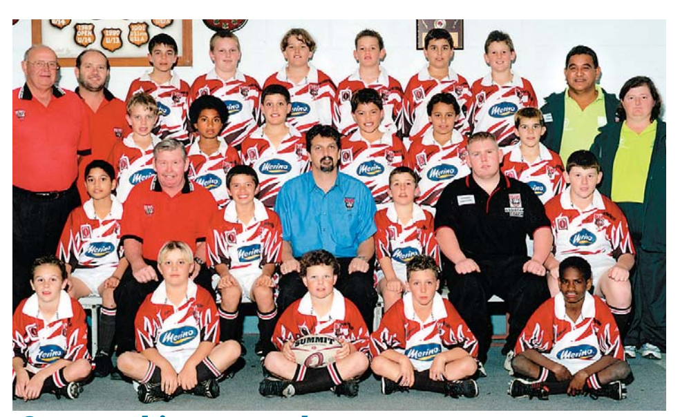
Sponsorship renewed Hutchies last year sponsored the Browns Plains Bears Under 12 Junior C and was so delighted with the boys' performance that the team will receive sponsorship again for this season.